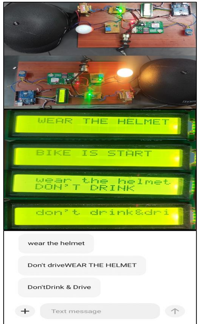
Figure 2 GSM Alert

being worn, a GSM alert is shipped off the driver's family to educate them regarding the likely risk, while likewise keeping the bicycle from beginning. This coordinated methodology advances mindful driving as well as supports consistence with fundamental security measures, possibly diminishing mishaps and cultivating a culture of more secure street propensities (Figure 2).